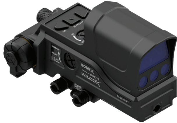
PRODUCT ILLUSTRATED IN BLACK (-B)