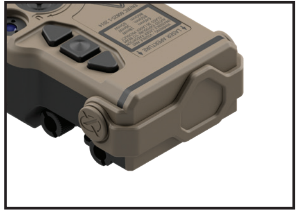
PRODUCT ILLUSTRATED** WITH LASER SAFETY COVER ASSEMBLY (COVER CLOSED)