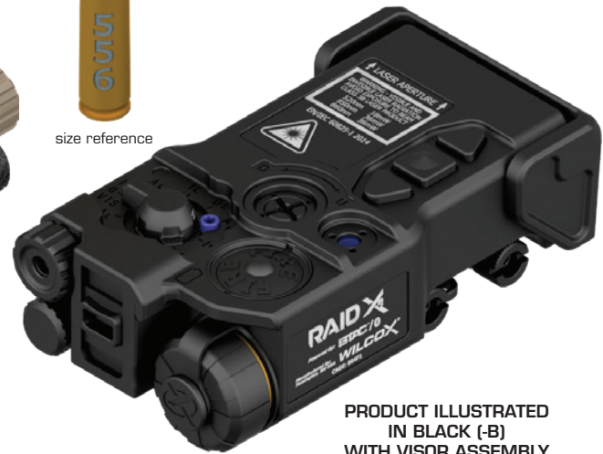
PRODUCT ILLUSTRATED IN BLACK (-B) WITH VISOR ASSEMBLY (VISOR CLOSED)