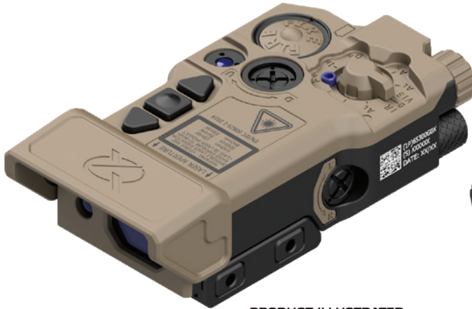
PRODUCT ILLUSTRATED IN COYOTE (-C) WITH VISOR ASSEMBLY (VISOR OPEN)