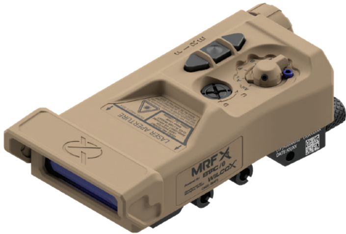
PRODUCT ILLUSTRATED IN COYOTE (-C) WITH VISOR ASSEMBLY (VISOR OPEN)