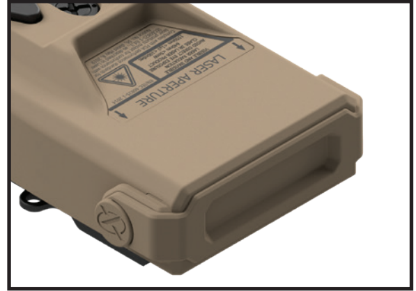
PRODUCT ILLUSTRATED WITH LASER SAFETY COVER ASSEMBLY (COVER CLOSED)